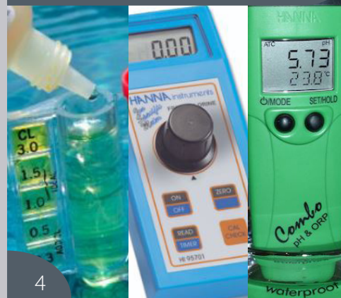
ORP meter, Pool test kit, Chlorine meter

It provides residual protection against recontamination, is easy to use and low cost.