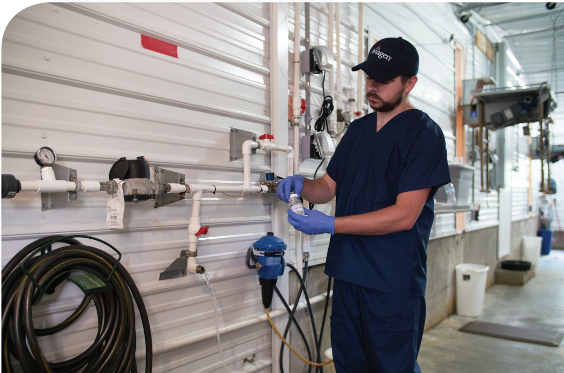
Sampling at the entrance of the house

Water disinfection during production is an integral part of a good flock management program. Controlling bacterial contamination and biofilm formation in the drinking system is key to reducing bird exposure to harmful organisms and minimizing the spread of disease. If allowed, chlorination is an effective way to achieve water sanitation, as it provides residual protection against recontamination, is easy to use and cost effective.