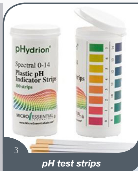
pH test strips