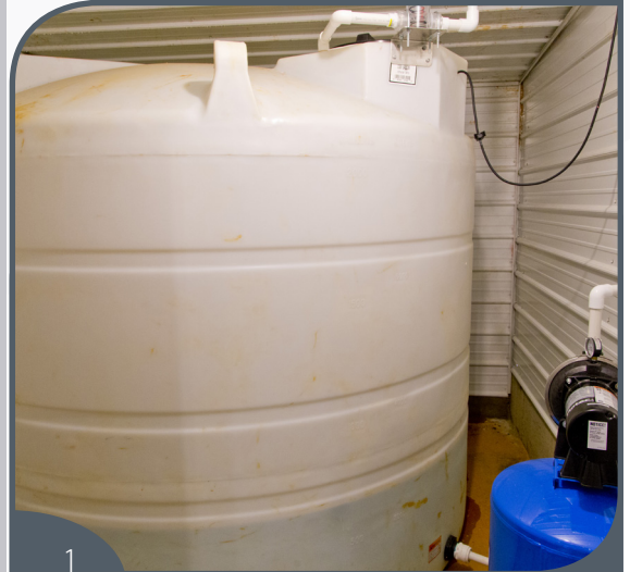
Holding tank for sanitized water